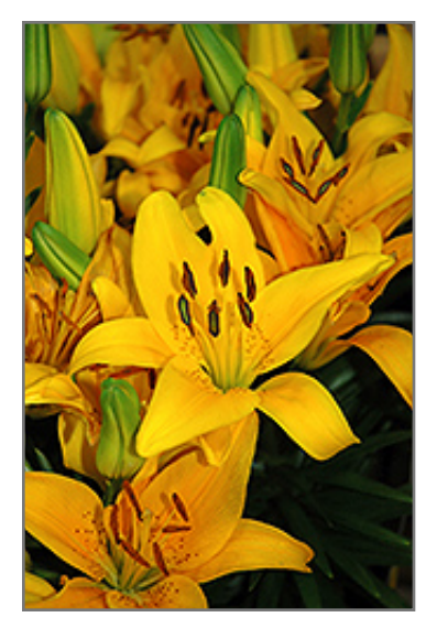
Lily Looks Tiny Bee Lily flowers

This variety is a compact lily that bears well formed, upward facing, bright yellow blooms, perfect for containers or massing along borders; they are also known to have multiple blooms per stem