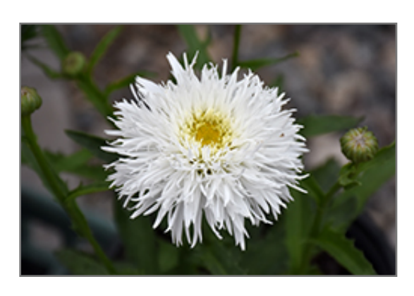
Sante Shasta Daisy flowers