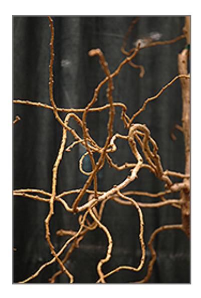
Horstmann's Recurved Larch bark