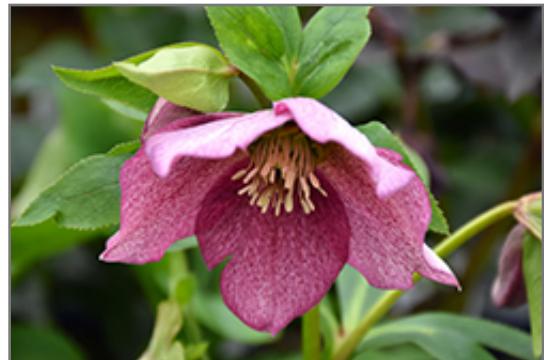
Royal Heritage Hellebore flowers