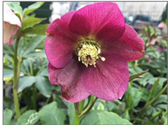
Royal Heritage Hellebore flowers

Royal Heritage Hellebore is recommended for the following landscape applications;