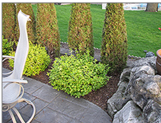
Country Gold Wintercreeper