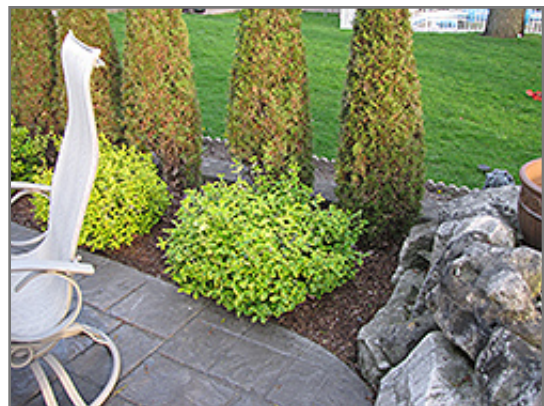
Country Gold Wintercreeper