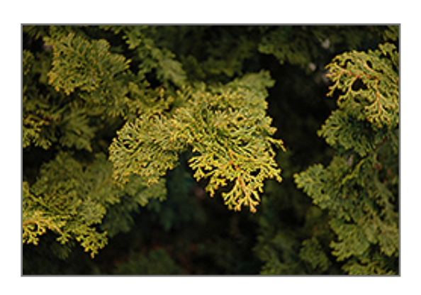
Slender Hinoki Falsecypress foliage

A graceful addition to any home landscape, this small accent tree features finely-textured deep green foliage all season long on a narrow pyramidal form; best used for skyline articulation or as an accent in the yard