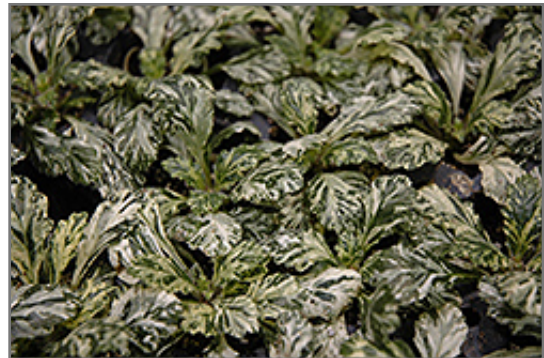
Sparkler Bugleweed foliage

Sparkler Bugleweed is recommended for the following landscape applications;