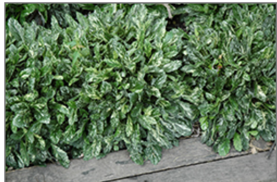
Sparkler Bugleweed