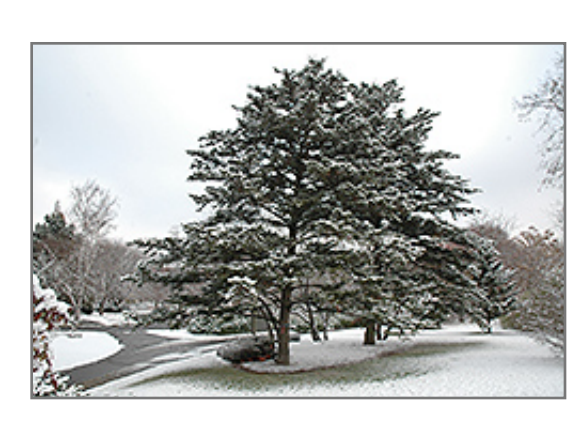
Nikko Fir in winter

A beautiful, symmetrical ornamental tree that is perfect for making a statement in the landscape or in a large garden; exceptional deep green foliage really stands out; broadens gracefully with age