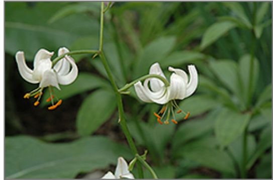
Blush Martagon Lily flowers