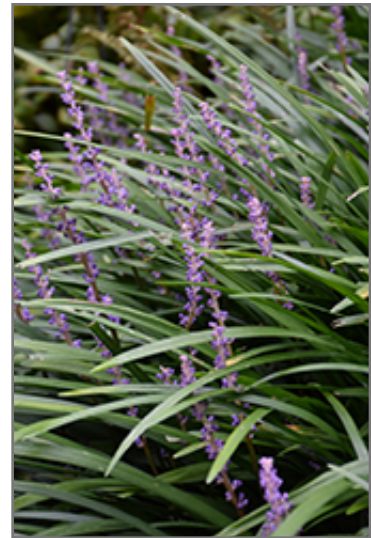
Big Blue Lily Turf flowers

Big Blue Lily Turf is recommended for the following landscape applications;