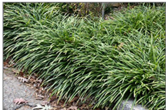
Big Blue Lily Turf