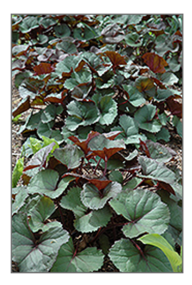
Woerlitzer's Gold Rayflower foliage