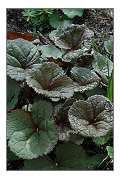
Dark Beauty Rayflower foliage