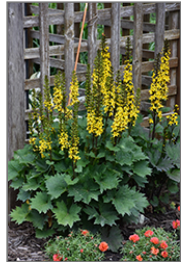
Little Rocket Rayflower in bloom