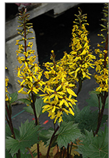
Little Rocket Rayflower flowers