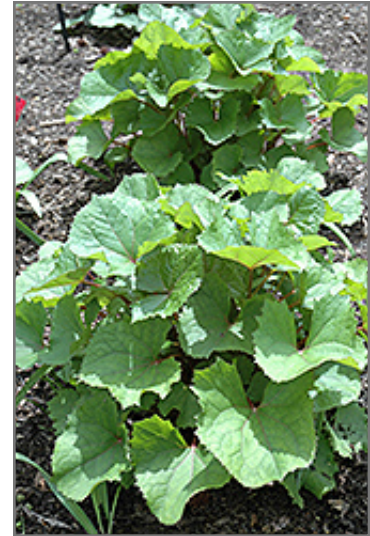
Little Lantern Rayflower foliage

Little Lantern Rayflower will grow to be about 20 inches tall at maturity, with a spread of 30 inches. It grows at a medium rate, and under ideal conditions can be expected to live for approximately 20 years. As an herbaceous perennial, this plant will usually die back to the crown each winter, and will regrow from the base each spring. Be careful not to disturb the crown in late winter when it may not be readily seen!