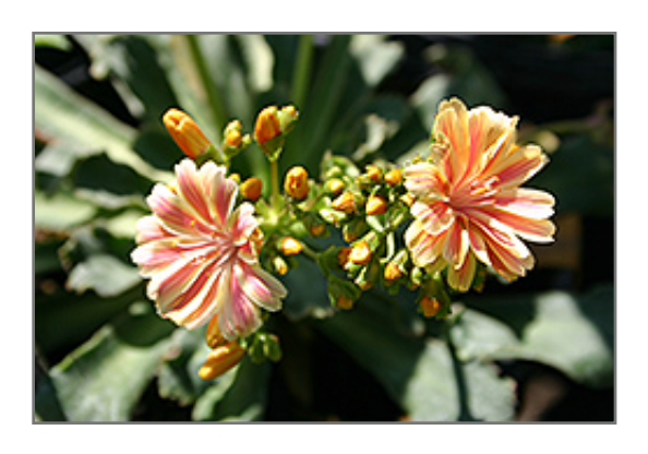
Sunset Group Bitterroot flowers

Stunning primrose-like flowers in brilliant shades of pink, salmon, violet, and orange rise above the deep green foliage; a succulent plant that is perfect for rock gardens or front border plantings