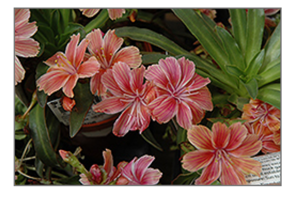
Little Plum Bitteroot flowers