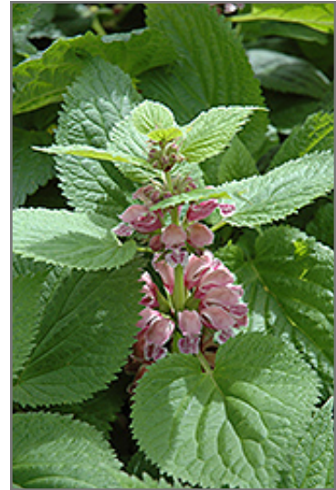
Silva Giant Dead Nettle flowers