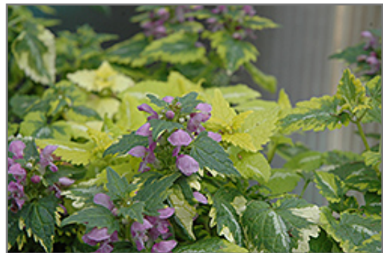
Anne Greenaway Spotted Dead Nettle flowers