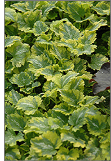
Anne Greenaway Spotted Dead Nettle foliage

This is a high maintenance plant that will require regular care and upkeep, and can be pruned at anytime. It is a good choice for attracting butterflies to your yard, but is not particularly attractive to deer who tend to leave it alone in favor of tastier treats. Gardeners should be aware of the following characteristic(s) that may warrant special consideration;