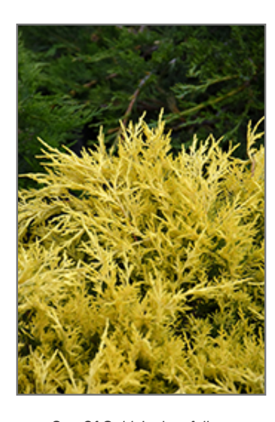
Sea Of Gold Juniper foliage

This is a relatively low maintenance shrub, and is best pruned in late winter once the threat of extreme cold has passed. Deer don't particularly care for this plant and will usually leave it alone in favor of tastier treats. It has no significant negative characteristics.