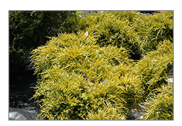
Sea Of Gold Juniper

Sea Of Gold Juniper is recommended for the following landscape applications;