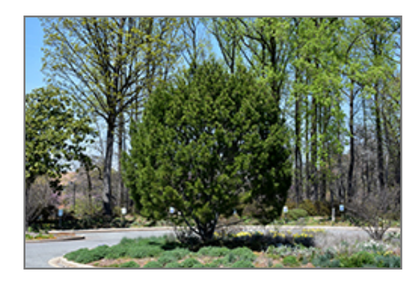
Lacebark Pine