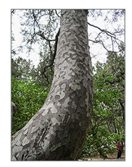
Lacebark Pine bark