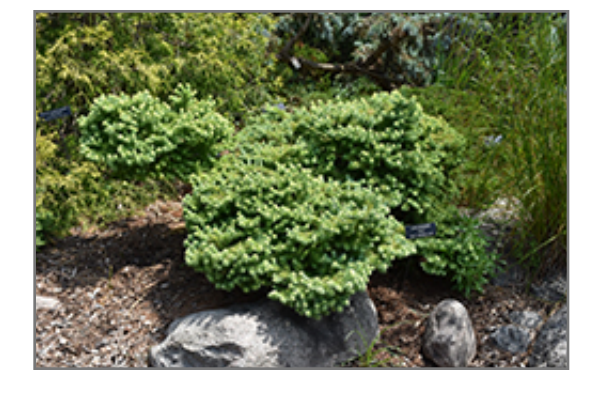
Dwarf Japanese Larch

Dwarf Japanese Larch is a multi-stemmed deciduous shrub with a more or less rounded form. It lends an extremely fine and delicate texture to the landscape composition which should be used to full effect.