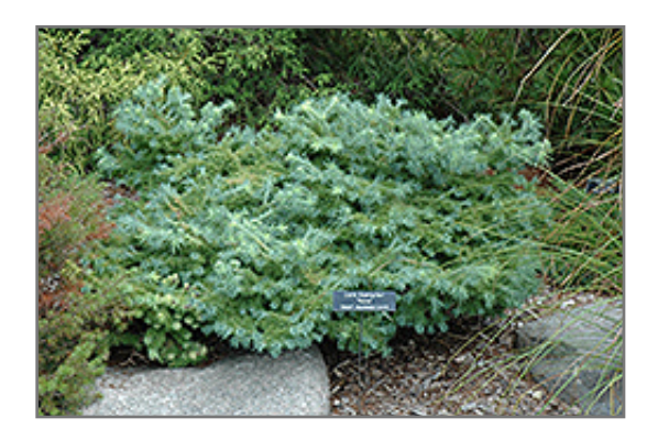
Dwarf Japanese Larch

This is a relatively low maintenance shrub, and should not require much pruning, except when necessary, such as to remove dieback. Deer don't particularly care for this plant and will usually leave it alone in favor of tastier treats. It has no significant negative characteristics.