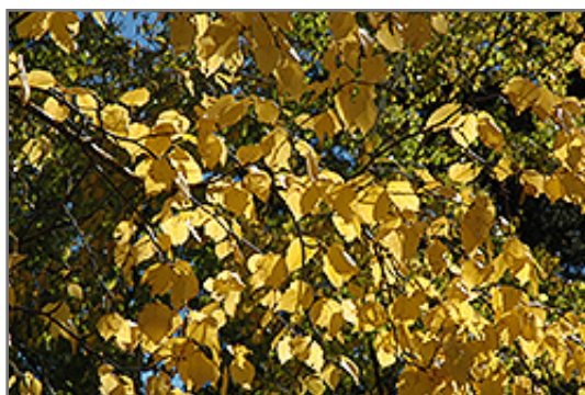
Paper Birch in fall