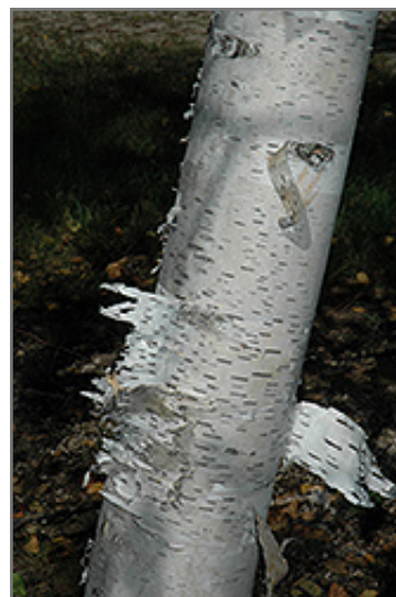
Paper Birch bark