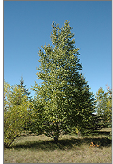
Paper Birch

This tree does best in full sun to partial shade. It prefers to grow in average to moist conditions, and shouldn't be allowed to dry out. It is not particular as to soil type or pH. It is somewhat tolerant of urban pollution. Consider applying a thick mulch around the root zone in winter to protect it in exposed locations or colder microclimates. This species is native to parts of North America.