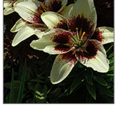
Black Spider Lily flowers

This attractive variety has lovely butter yellow blooms sprinkled with deep burgundy-red spots that fill in to solid burgundy in the center; the attention getting contrast of these colors makes this one a perfect choice for a border or garden accent