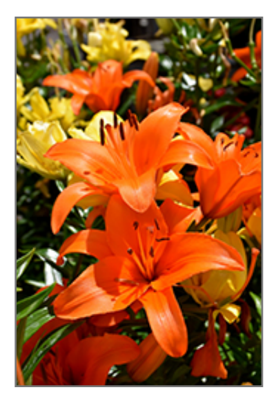
Brunello Lily flowers

A captivating warm spotless orange will greet the eye when this hardy variety is in bloom; there may be an occasional streak of red in these flawless symetrical blooms that will make a lovely accent to a hedge or low shrubbery