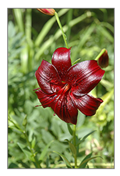
Dark Moon Lily flowers

Flowers are a true deep dark red, making for a bold and audacious statement in the garden; plant next to lighter flowers for a stunning garden composition