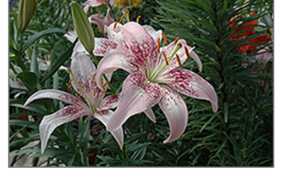
Dot Com Lily flowers