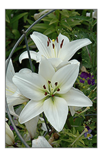
Endless Love Lily flowers

This stunning beauty is one of the purest white Asiatic lilies available, and a real winner for its heavy bud count; each large flower opens wide for a glorious presentation for border or massing applications