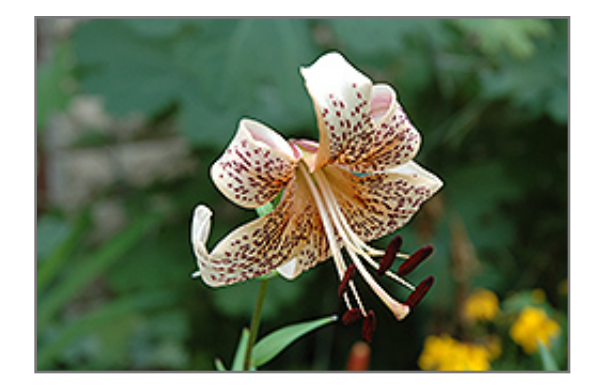
Katinka Lily flowers

Katinka Lily is recommended for the following landscape applications;