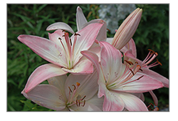
Marlene Lily flowers