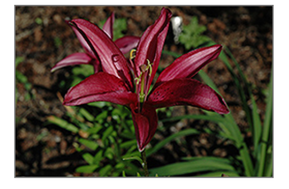
Midnight Passion Lily flowers