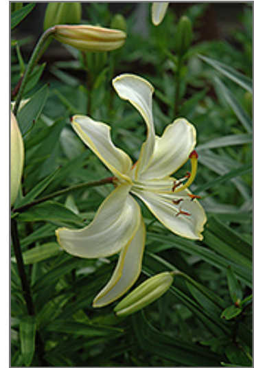
Monique Lily flowers

Monique Lily features bold nodding white trumpet-shaped flowers with yellow edges at the ends of the stems in mid summer. The flowers are excellent for cutting. Its narrow leaves remain green in colour throughout the season.