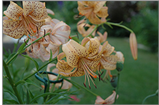
Peach Butterfly Lily flowers