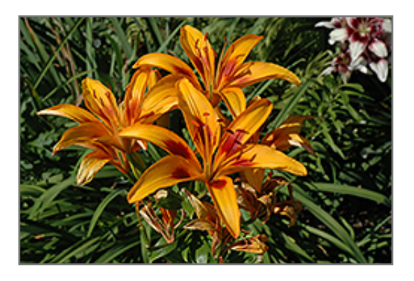
Picasso Lily flowers