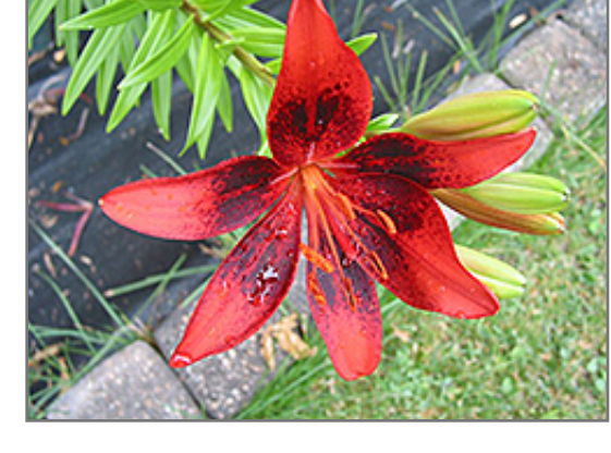
Pup Art Lily flowers