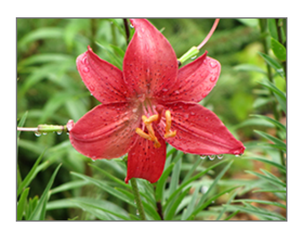
Red Velvet Lily flowers