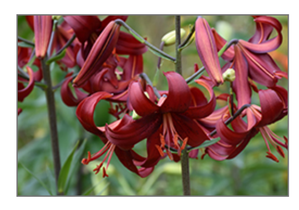
Red Velvet Lily flowers

Red Velvet Lily will grow to be about 3 feet tall at maturity extending to 4 feet tall with the flowers, with a spread of 3 feet. When grown in masses or used as a bedding plant, individual plants should be spaced approximately 24 inches apart. It tends to be leggy, with a typical clearance of 1 foot from the ground, and should be underplanted with lower-growing perennials. The flower stalks can be weak and so it may require staking in exposed sites or excessively rich soils. It grows at a fast rate, and under ideal conditions can be expected to live for approximately 10 years. As an herbaceous perennial, this plant will usually die back to the crown each winter, and will regrow from the base each spring. Be careful not to disturb the crown in late winter when it may not be readily seen!