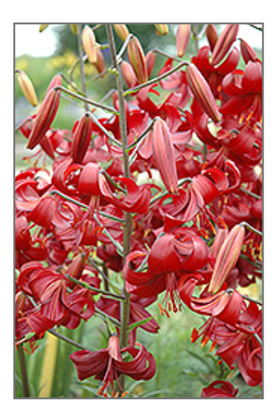
Red Velvet Lily flowers