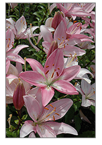
Renoir Lily flowers

Renoir - as lovely as a fine painting by its namesake; glorious soft pink blooms with deeper pink veins make a spectacular display in early summer; upward facing blooms are very romantic for cut flowers and for perennial borders