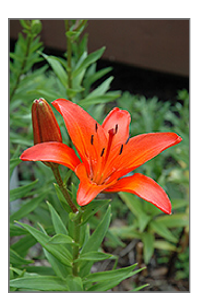
Tabasco Lily flowers

A stunning hardy lily producing dazzling orangey-red blooms that are truly captivating to the eye; multiple and mostly upright flowers are very showy at the top of sturdy long straight stems; long lasting in the garden as well as cut