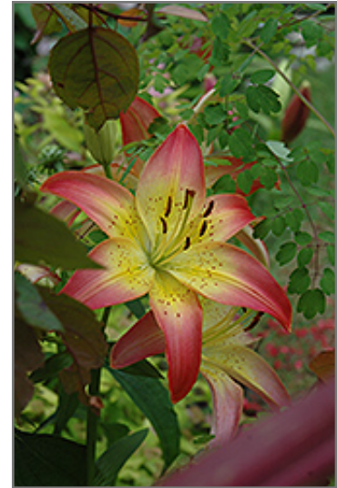
Tropical Dream Lily flowers