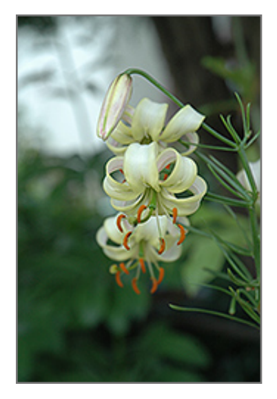
Nodding Lily flowers

A small variety which reliably produces fabulous flowers that are cream with pink tips, petals are strongly curved outwards, flowers are pleasantly perfumed; foliage is tidy and grass-like serving to enhance the flowers