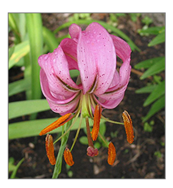
Nodding Lily flowers

A delicate variety which is adorned with fabulous flowers of pale purple, stippled and dotted caramine; flowers are strongly recurved and pleasantly perfumed; foliage is tidy and grass-like serving to enhance the flowers