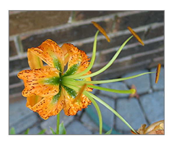
Henry's Lily flowers

This vigorous lily is easy to grow in neutral to alkaline soils and partial shade as under trees; produces tall stems of lightly scented, deep orange flowers with dark red anthers in late summer; an excellent choice for border plantings and massing