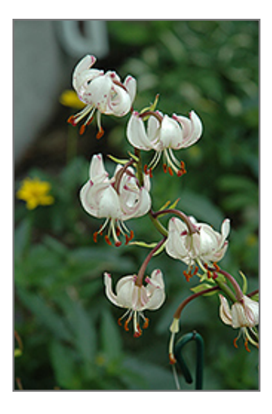
Glacier Martagon Lily flowers

A classic woodland lily with small delicate, and shiny pendant flowers that are a striking white, nodding gracefully from sturdy stems; has beautiful form appeal, best in partial shade