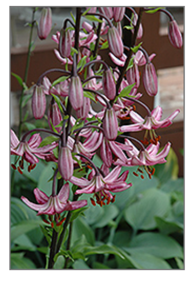
Pink Attraction Martagon Lily flowers

Attractive upright blooms that are a lovely shade of light pink; impressive when massed in an area or as a border planting, best in partial shade