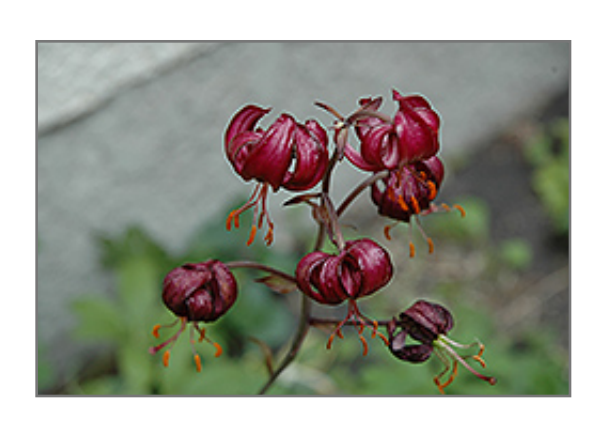
Sarcee Martagon Lily flowers

A stunning and very interesting variety; dark stems reach up to deep-deep red blooms, petal edges are nearly black; with contrasting bright orange pollen, this flower is truly a beauty to behold; excellent massed, best in partial shade