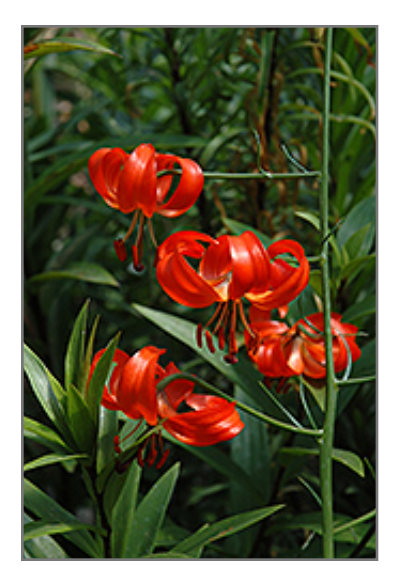
Coral Lily flowers