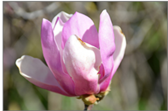
Jane Magnolia flowers