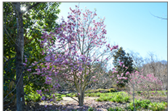
Jane Magnolia in bloom