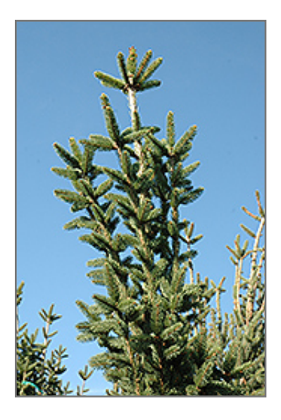
Columnar Norway Spruce foliage