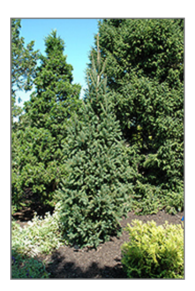
Columnar Norway Spruce