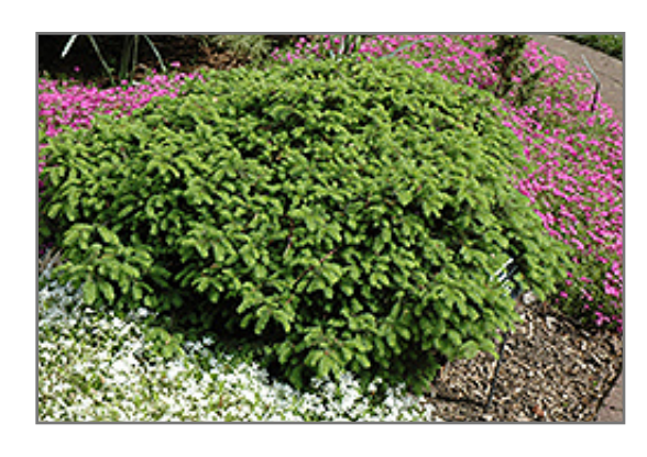
Elegans Spruce

Elegans Spruce is recommended for the following landscape applications;