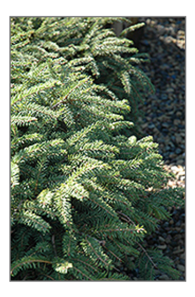
Elegans Spruce foliage