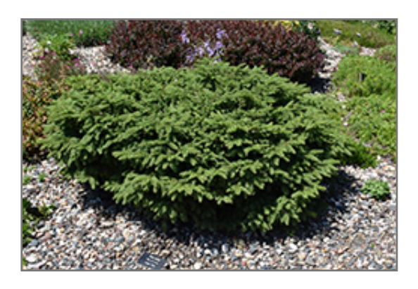
Elegans Spruce

This shrub should only be grown in full sunlight. It does best in average to evenly moist conditions, but will not tolerate standing water. It is not particular as to soil type or pH, and is able to handle environmental salt. It is highly tolerant of urban pollution and will even thrive in inner city environments. This is a selected variety of a species not originally from North America.