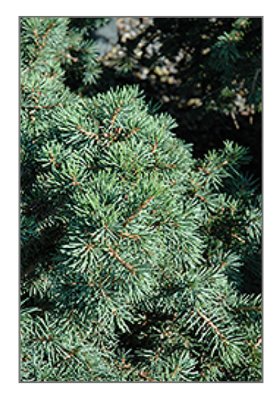
Parson's Dwarf Spruce foliage