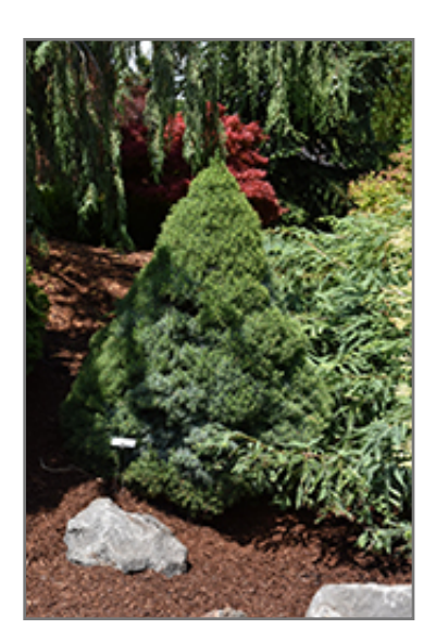
Alberta Blue Dwarf Spruce

Alberta Blue Dwarf Spruce will grow to be about 6 feet tall at maturity, with a spread of 3 feet. It tends to fill out right to the ground and therefore doesn't necessarily require facer plants in front, and is suitable for planting under power lines. It grows at a medium rate, and under ideal conditions can be expected to live for 50 years or more.